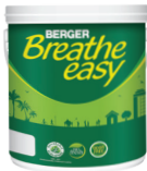
Breathe Easy Water Sealer