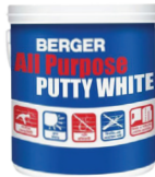
All Purpose Putty